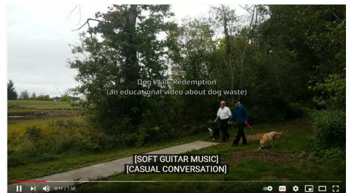
Stormwater Outreach Video - Dog Walk Redemption

All three COVID-19 vaccines with FDA Emergency Use Authorization are now available in NH and are available, free, during the mobile clinics.