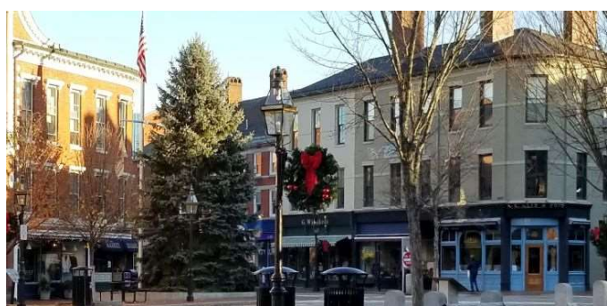
PORTSMOUTH'S HOLIDAY TREE DONATED BY THE RESIDENTS OF OSPREY LANDING -a 35-foot Colorado Spruce.

holiday-lights-contest Register by Dec 10. Judging takes place between Dec 11 and 19, with winners announced at the City Council meeting Dec 20. Seacoast Media Group is the media sponsor.